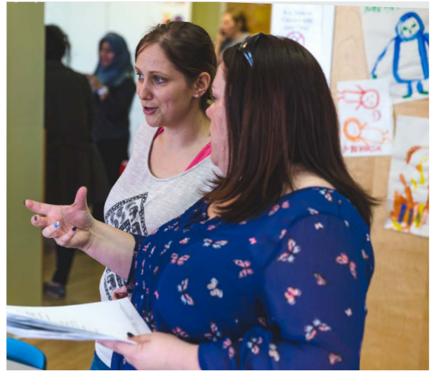
Two colleagues having a discussion

It is important for RECEs employed as supervisors to understand that they may be held to a higher standard by others, including families, colleagues and the College, in regards to their formal positions of supervision of supervisees.