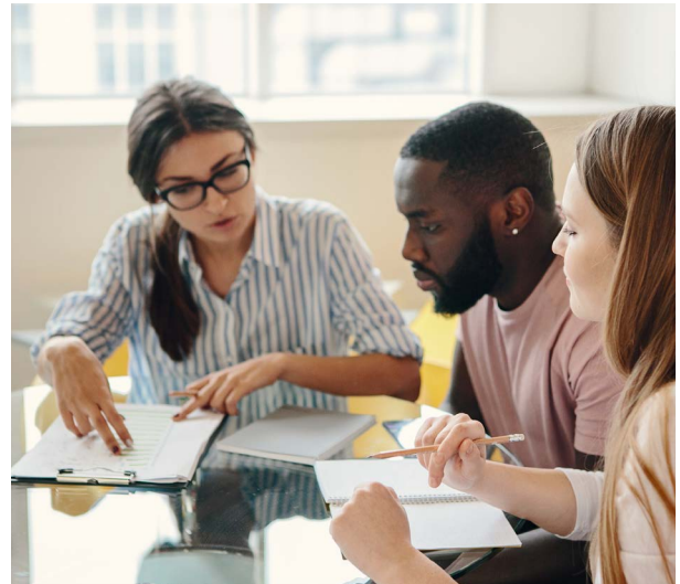
Colleagues in a meeting

Supervision will also be informed by circumstances in the practice setting. RECEs use their professional judgment regarding the level of supervision (i.e. scaffolding guidance) required to support a supervisee.