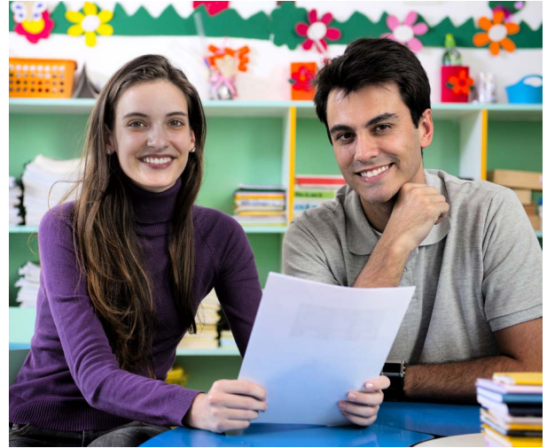
Two colleagues in an early learning environment

Remember, early childhood education placement students and those new to the profession will require extra support and guidance from the RECEs supervising them.