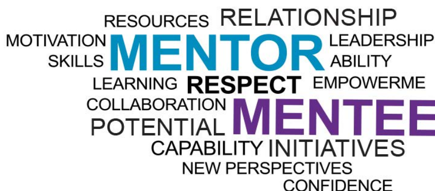
Mentorship word map graph