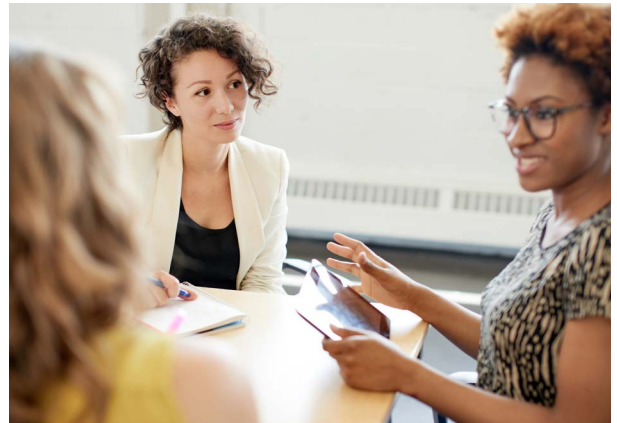
Colleagues working together

RECEs hold positions of trust and responsibility, not only with children under their professional supervision, but also with supervisees. Many RECEs working in a variety of roles and settings provide professional supervision of supervisees, so this practice note can apply to all RECEs.