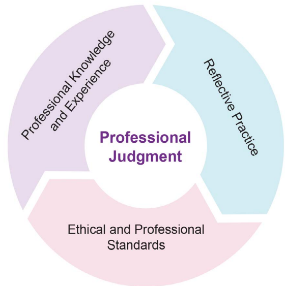
Professional judgment graph

These ideas on using professional judgment are revisited with examples in the Professionalism and Accountability section of this Practice Note.