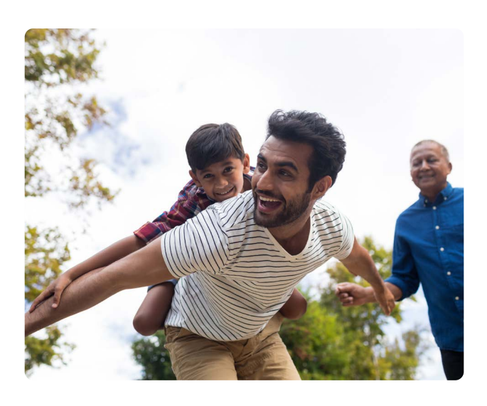
Figure 7: Child playing with family

To co-create culturally appropriate pedagogy, curriculum, resources, policies and programs, RECEs must be mindful of diversity and culture. One way RECEs do this is by developing and maintaining strong professional relationships.