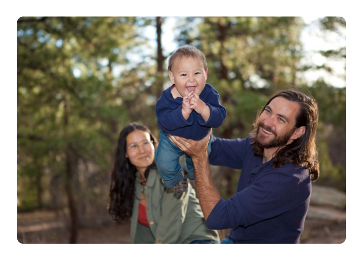
Figure 12: Child with family

Children and families bring diverse social, cultural and linguistic perspectives to the practice setting. How Does Learning Happen? (2014) says that when children's home languages and cultures are reflected in the environment it supports children's language skills and contributes to cultivating their identity and sense of themselves. It's vital that families feel a sense of belonging so they can be valuable contributors to their children's learning.