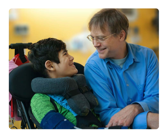
Figure 9: Adult engaging with school-age child

Get to know different people and social groups personally. Engage in ongoing learning and connect with communities of practice who are doing inclusion and equity work. In doing so, RECEs can increasingly recognize discrimination, unfairness and develop language to describe and address it effectively while supporting children to do the same. When RECEs generate environments that value different social identities, children learn they're valued, and, in turn, they learn how to treat others with fairness and respect. As a leader, you model humility and a willingness to learn by taking responsibility for any biased actions taken, even if unintended, and actively work to repair the harm and use the opportunity to learn and reflect (NAEYC, 2019).