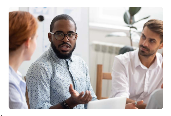
Figure 15: Educators in a meeting

Supervisors also ensure that the pedagogical support they offer staff aligns with equity, diversity and inclusion. They guide staff to see how their personal beliefs might unconsciously influence pedagogical practice and which children, families and colleagues they focus on and why. This is important; research demonstrates that children from particular cultures and backgrounds are often unconsciously seen by educators in stereotypical ways or as having specific characteristics and behaviours that afford them certain levels of intelligence, skill or even specific problems and aggressive tendencies (NAEYC, 2020).