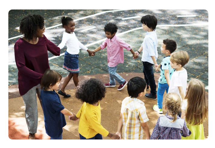
Figure 1: Educator with a group of children outdoors