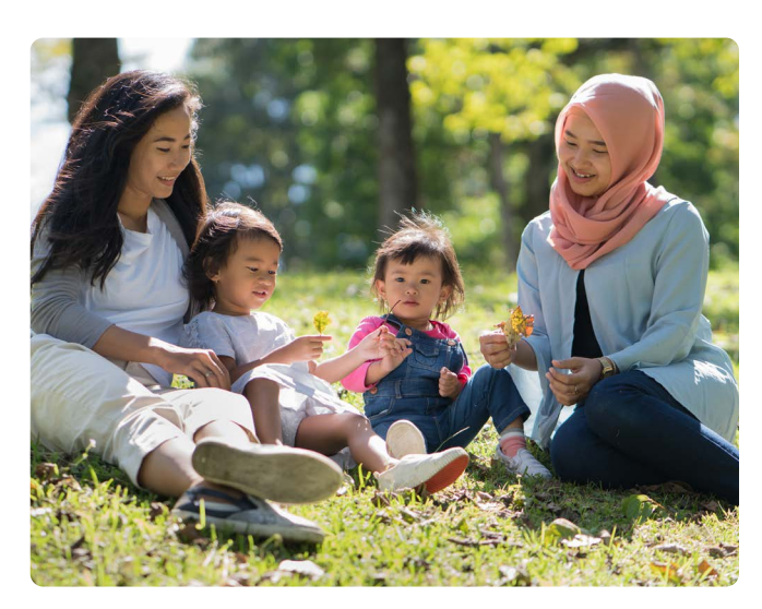
Figure 5: Adults with children outdoors