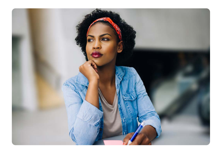
Figure 10: Educator engaged in self-reflection

RECEs ensure that the policies governing their practice setting promote equity, diversity and inclusion, and they ensure that they adhere to the policies. Review these policies in your workplace and consider what you could do or say if you witness someone in the learning community making negative assumptions about or discussing someone, a particular idea or a cultural practice in a negative way.